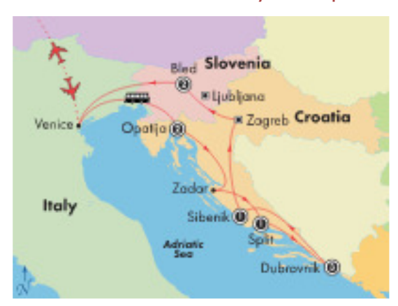
DAY 1, Sunday - Depart for Italy Depart for Italy

*call for dates and rates from your departure city